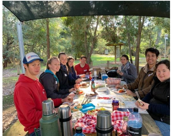
Members of the Upper Goulburn Intrepid Tribe

For data to be valid at least 2 observations per week have to be recorded. So help us by spending 10 minutes of quiet time and seeing what you can see.